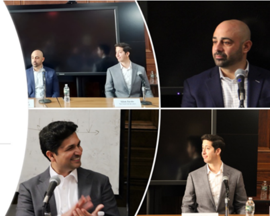
Real Estate Alumni Career Panel Spring 2025

Every year, we co-host the Alumni Career Panel with the Starr Career Center and invite accomplished real estate alumni to share their insights and experiences.