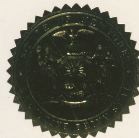
Governor June 2002

on the occasion of his 70 th birthday and in honor of his great contributions to our State, Nation, and society as a whole.