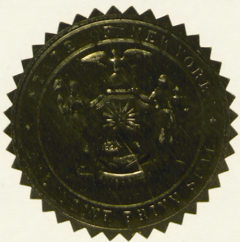
Governor June 2002

on the occasion of his 70 th birthday and in honor of his great contributions to our State, Nation, and society as a whole.