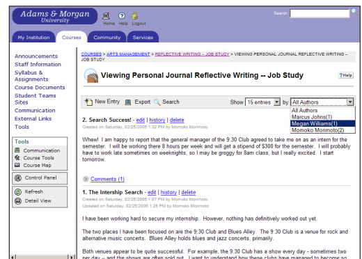
Reflective journaling assignment